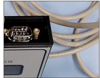
Figure 2: DB9 Connector