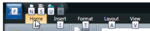
Figure 3: Key tips. Press <Alt> + the badge letter.