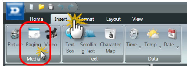
Figure 1: Select the Insert tab, then click on Paging icon.

✓ Tip: When Paging is selected, you will also see a Page Storyboard at the bottom of Content Studio, next to your Timeline and Layout Storyboard (see figure 4).