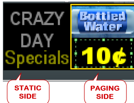
Figure 3: Static content is entered on the layout while changing content is entered in the Paging area.