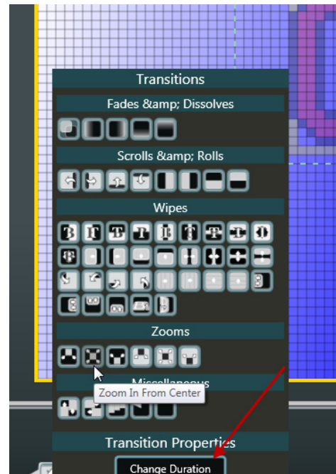
Figure 1: Change the duration of a transition.

✓ Tip: You can also lengthen the duration of a transition in the Timeline by dragging the transition bar (see figure 3).