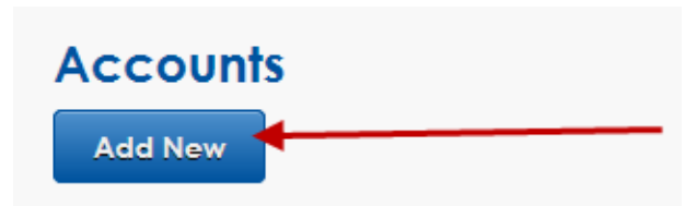
Figure 1: Add New button