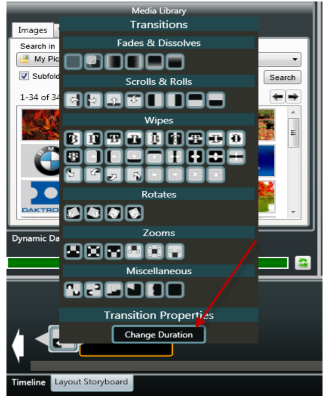
Figure 1: Change the duration of a transition.