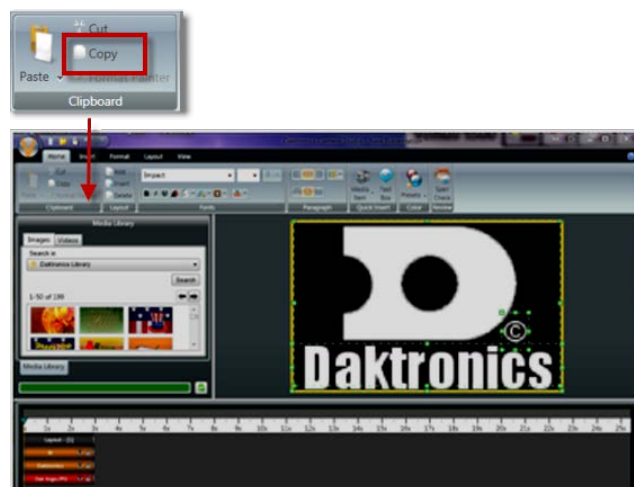
Figure 2: All elements that are highlighted with a dotted green border are selected and copied when click on copy.